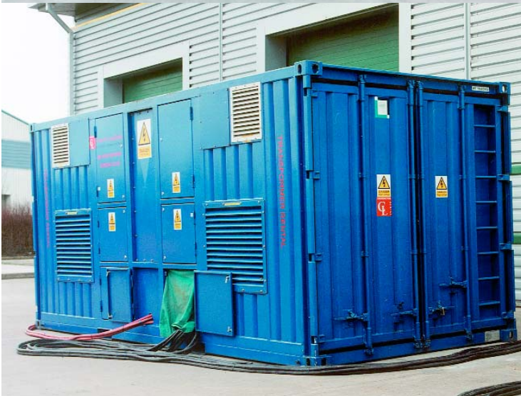
Crestchic containerised 5MVA transformer