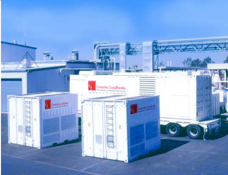
One Crestchic 5MVA and two 3.3 MVA Resistive Reactive loadbanks